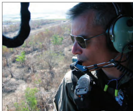
Conducting an aerial search and damage assessment during a FEMA deployment.

As a former Operations Specialist serving with the Federal Emergency Management Agency (FEMA), I responded to major presidentially declared disasters nationwide. Operating in austere environments without electricity, communications, and other essential services has motivated me to teach others disaster preparedness skills to better prepare the public in case of disaster.