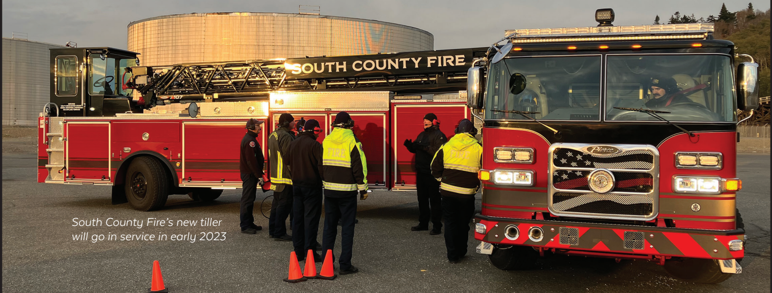
South County Fire's new tiller will go in service in early 2023