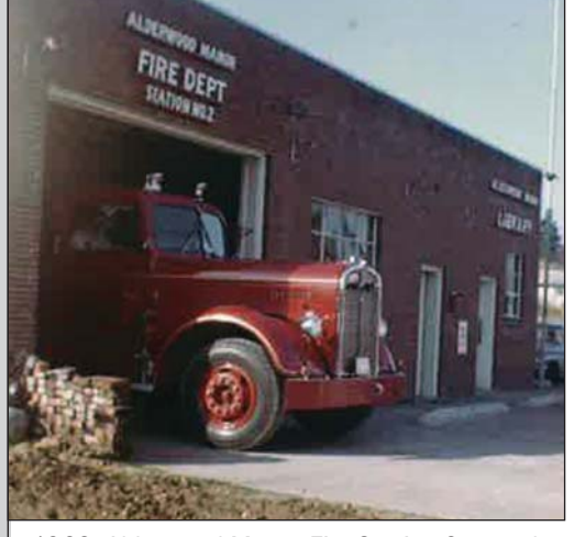
1963: Alderwood Manor Fire Station 2 near the site of today's Lynnwood Convention Center.